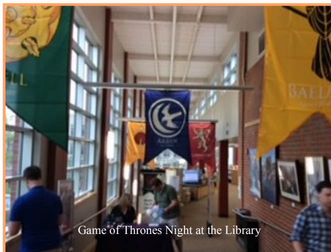
Game of Thrones Night at the Library