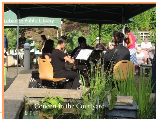
Concert in the Courtyard

"Mt. Lebanon Public Library is one of the reasons I stay in the community."