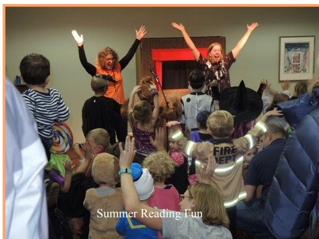
Summer Reading Fun

Shortcuts to all our social media accounts can be found on the bottom of our website.